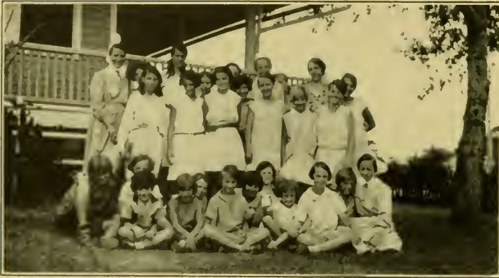
A group of Lankenau Girls with their teachers at the summer cottage, Cape May Point.